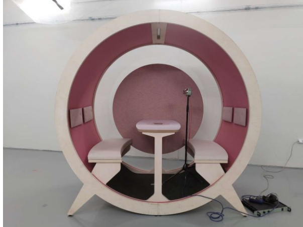
Figure A3.1. The front side of the test specimen.

The specimen was assembled in the middle zone of the reverberation room (201 m 3 ). The distance from the walls was over 1.0 m. The depth of the specimen was 1100 mm and outer diameter of the circular shape 2155 mm.