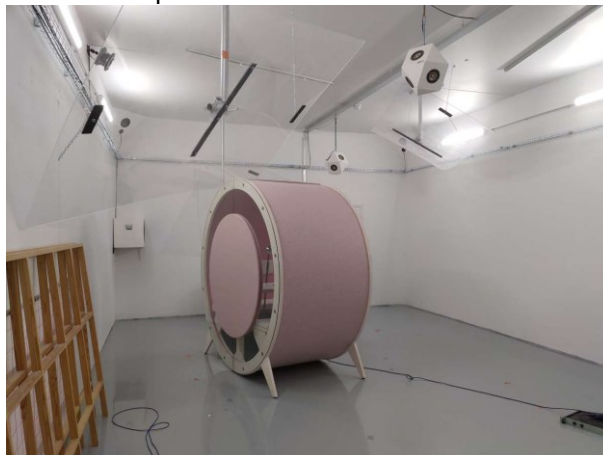
Figure A3.2. The test specimen in the measurement location in the reverberation room.