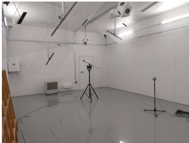
Figure A3.3. The reverberation room without the test specimen.