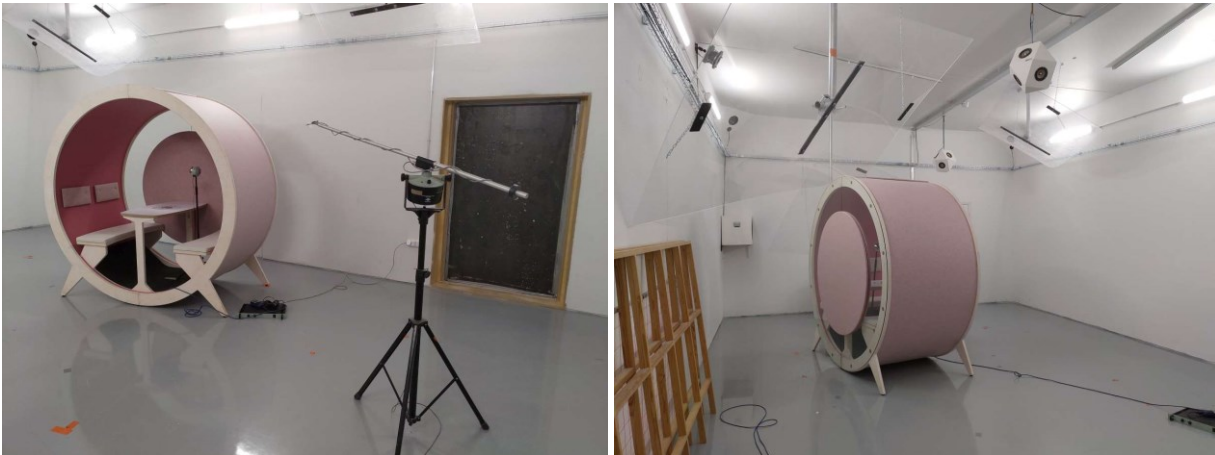
Figure A3.1. The test specimen mounted in position 1 (left) and in position 2 (right) in the reverberation room. The sound source was a mouth simulator (Brüel&Kjær 4227) that has similar sound directivity as a speaking person.

Measurements were conducted in a reverberation room (Volume 201 m 3 ). The specimen was in two different positions in reverberation room during the measurements. The distance from the walls to the specimen surface was over 1.0 m. The depth of the specimen was 1100 mm and outer diameter of the circular shape 2155 mm.