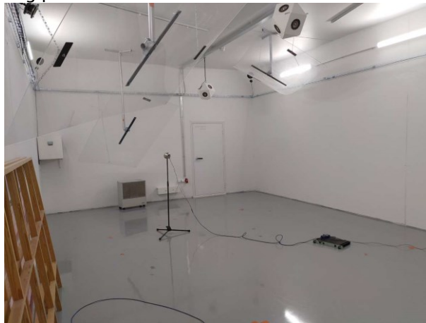
Figure A3.2. The sound source in position 2 in the empty reverberation room without test specimen.